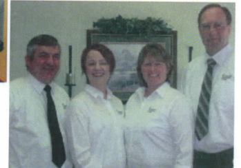
Community Insurance Group